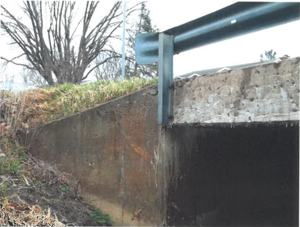
Crazing and leacate noted in the upper slab

Additionally, there are components of the structure which we have continued to monitor that will warrant additional attention in the coming years.