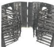
Paint Removal System