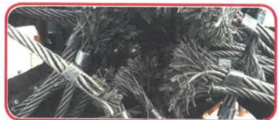
Inside of Plug Hug after 500 hydrant cleaning cycles. Notice lack of any wear on cable assemblies.

For a Demo, Cost Analysis or Proposal Contact: Doug Marshall douglasmarrshall@theplughug.com / 719 313 2791