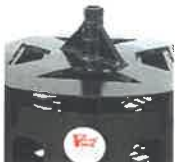
Standard industry Hex Drive