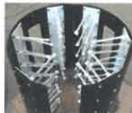
Snow Removal System