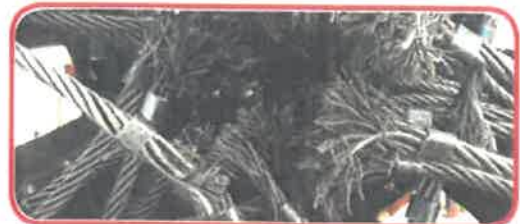
Inside of Plug Hug after 500 hydrant cleaning cycles. Notice lack of any wear on cable assemblies.

For a Demo, Cost Analysis or Proposal Contact: Doug Marshall douglasmarrshall@theplughug.com / 719 313 2791