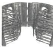
Paint Removal System