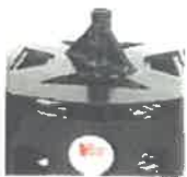
Standard industry Hex Drive