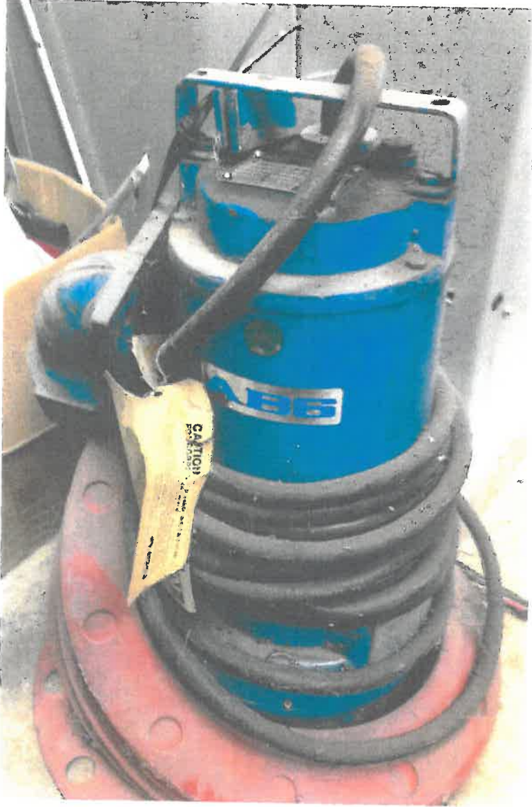
ABS Pump Photo